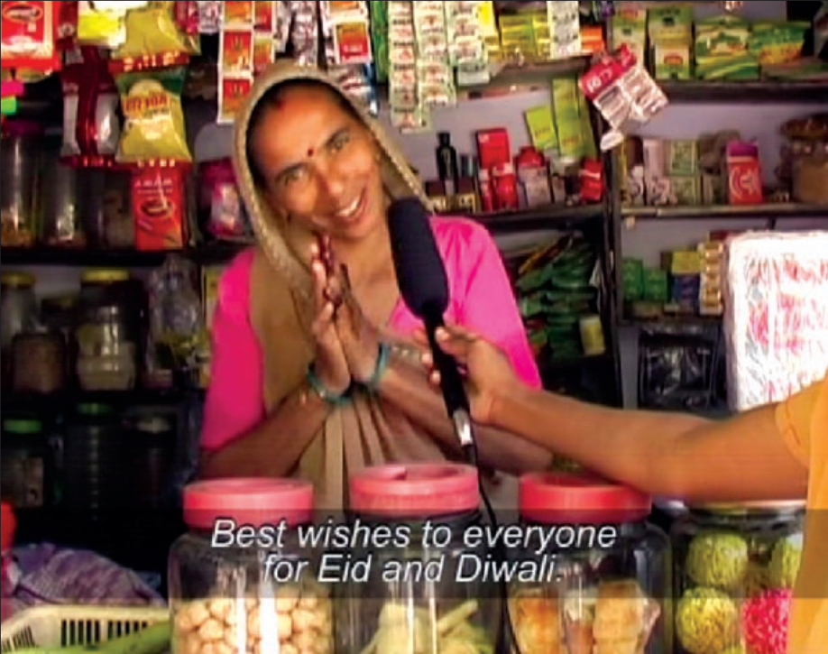
A shopkeeper shares her best wishes for Eid and Diwali in Samvad's Communal Harmony magazine, which helped bridge divisions between Hindus and Muslims in Gujarat.

is optimistic that it won't always be like that. "In a few years time, I am sure we will see Dalits sitting on chairs too," he says.