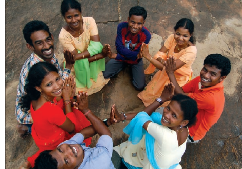
Producers from Manyam Praja Video / "Forest People's Video"