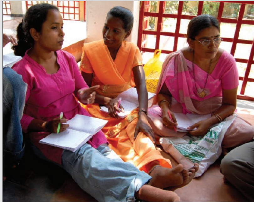
The Community Producers learn to recognize human rights violations and find possible solutions to the issues they are addressing.

The women rejected many of the arguments that NGOs usually make to try to stop child marriage, such as calling it "institutionalized child rape." Instead, they