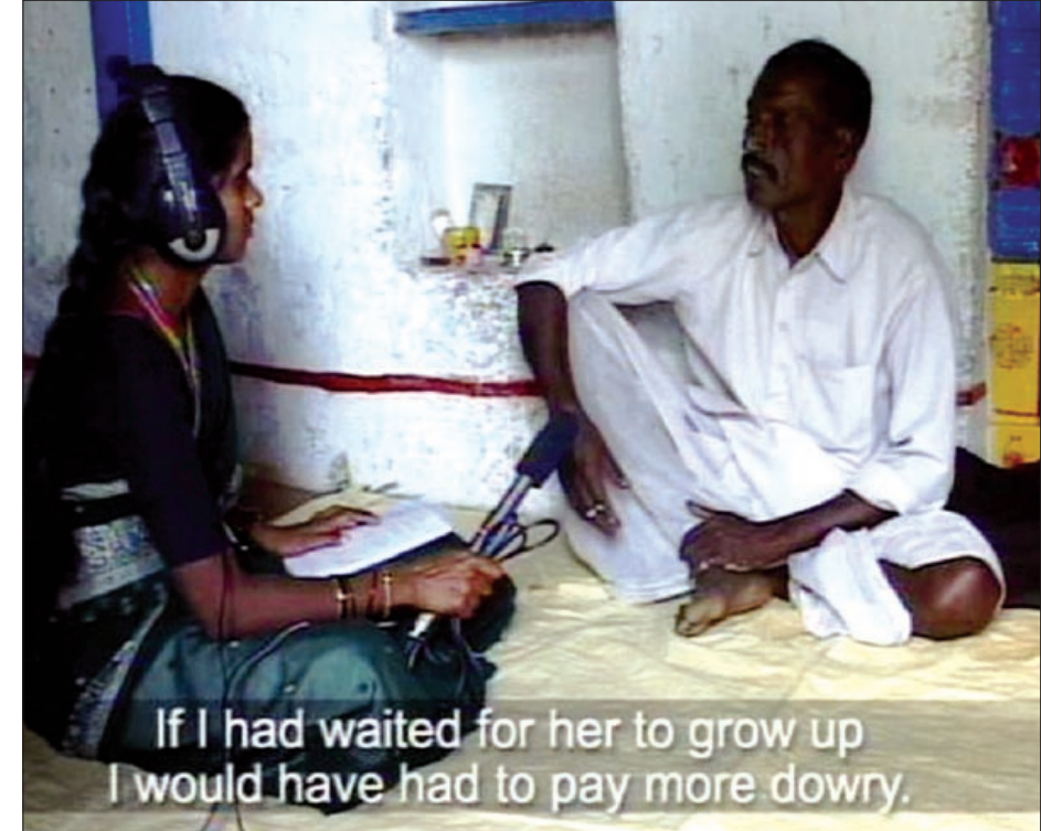
A Producer, who was married herself at 14, talks to a man about why he married off his daughter at such a young age. He ends the interview by saying he regrets the decision, which is quite a brave admittance coming from a man who is a respected village elder. This scene exemplifies the way community video can encourage people to do a little soul searching and confront touchy subjects they usually avoid.

In 2005, Video Volunteers worked with a group of 11 women who had been married as children in rural Andhra Pradesh to produce a pilot magazine.