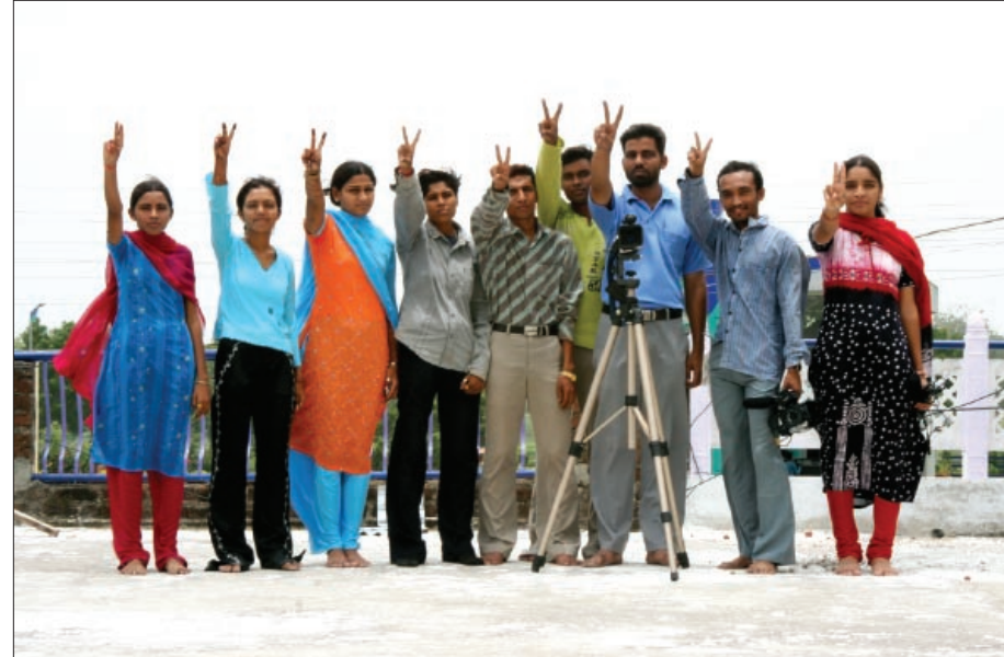
Producers from Sakshi Media / "Witness Media"

< Producers from Hamari Awaaz / "Our Voice"