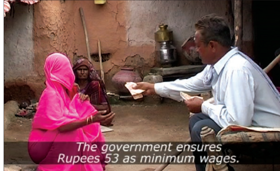
For years, the woman pictured above has been paid a pittance for her work as a farm laborer because she didn't know what the minimum wage was. When the Producers at Apna Malak Ma interviewed her, her employer also wanted to speak: "I also didn't know there was a minimum wage," he said. "Now, I promise to always pay my workers the minimum wage." This was an interesting example of how the desire to look good on camera can encourage positive changes in unexpected places.

The gutters, roads and public toilets in the Ahmedabad slums were horrendous. The government tried to kick-start a program to address the situation. As part of the program, people were required to make a small financial contribution. The fliers that the officials distributed weren't enough to convince people to invest. Nobody was signing up. Samvad made a film explaining why it was worthwhile, and finally, after many years, people started enrolling in large numbers. Thanks to the film, the infrastructure has greatly improved.