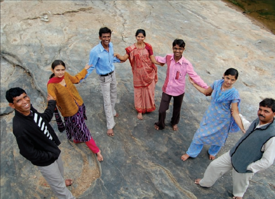
Producers from Apna Malak Ma / "In Our Land"