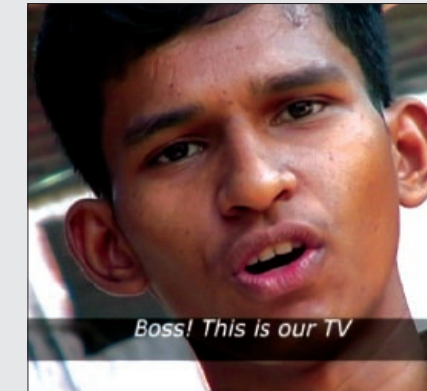
Apna TV ("Our TV"), a CVU based in Mumbai, starts off their video magazine with a lively montage of regular people announcing to the camera that the unit belongs to them.