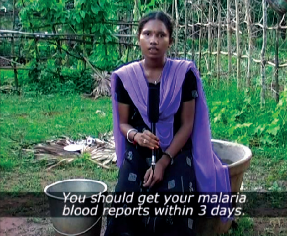
Manyam Praja Video gave viewers the straight facts in their video magazine about malaria. They also urged the audience to “speak out strongly” if officials visit their village.

wing of lawyers who provide legal advice. Armed with this knowledge, people are then empowered to file claims and to fight for their rights under the law.